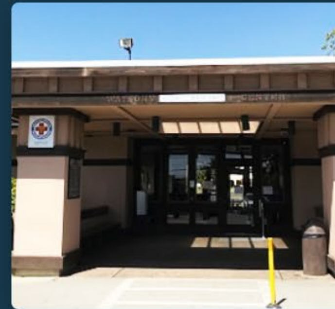
Watsonville Health Center