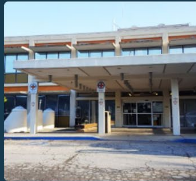
Santa Cruz Health Center