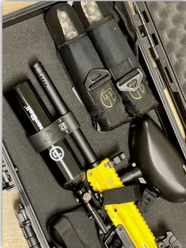
Category 12 (PepperBall)