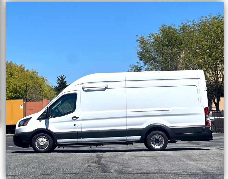
Category 2 (Armored Van)