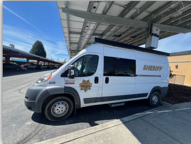
Category 5 (Mobile IC)