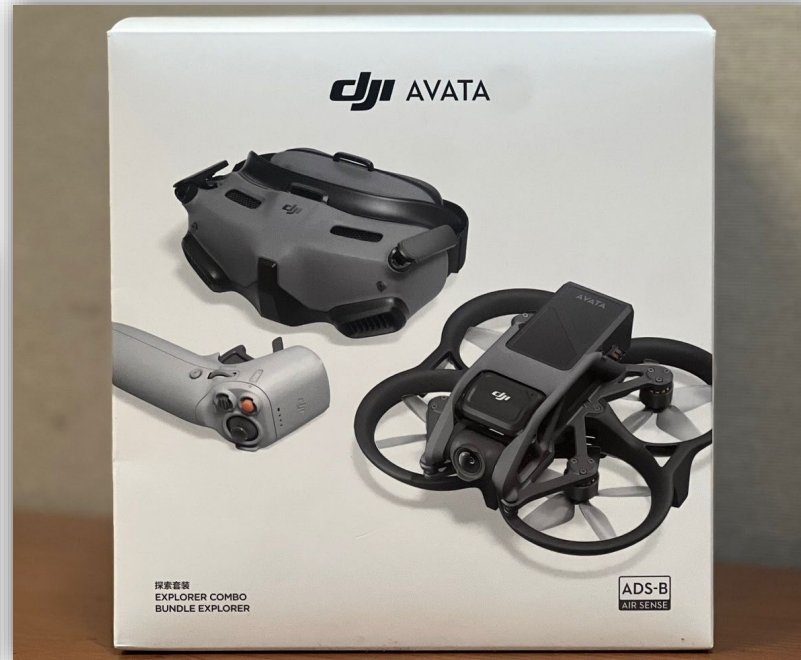
Category 1 (UAS)