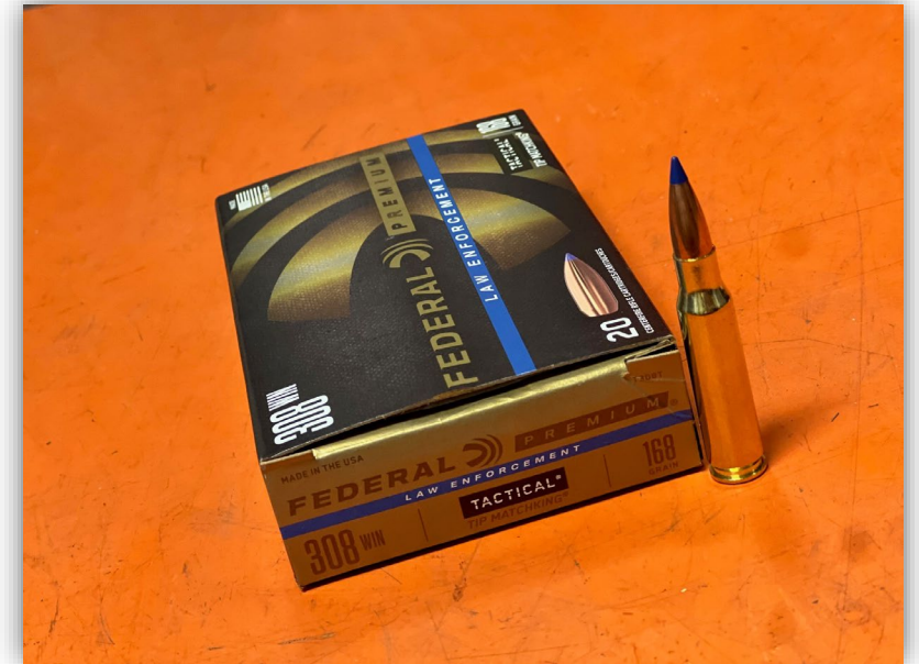
Category 9 (.308 Ammo)