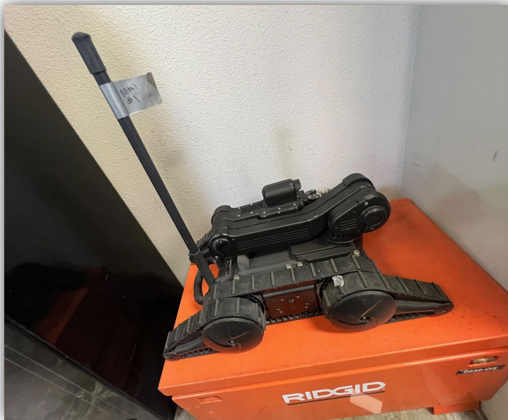
Category 1 (Robot)