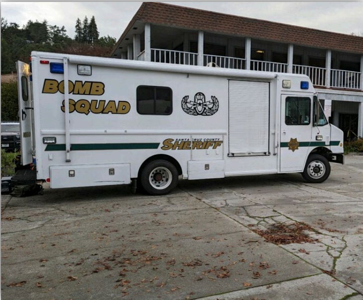
Category 5 (BOMB IC)