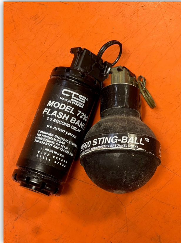
Category 12 (Flashbang/Stingball)