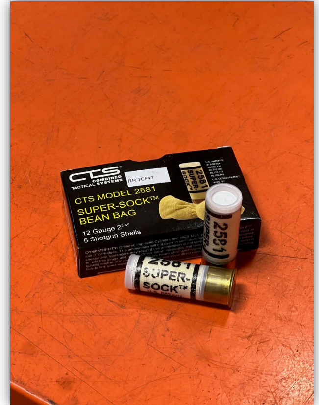
Category 14 (Beanbag Round)