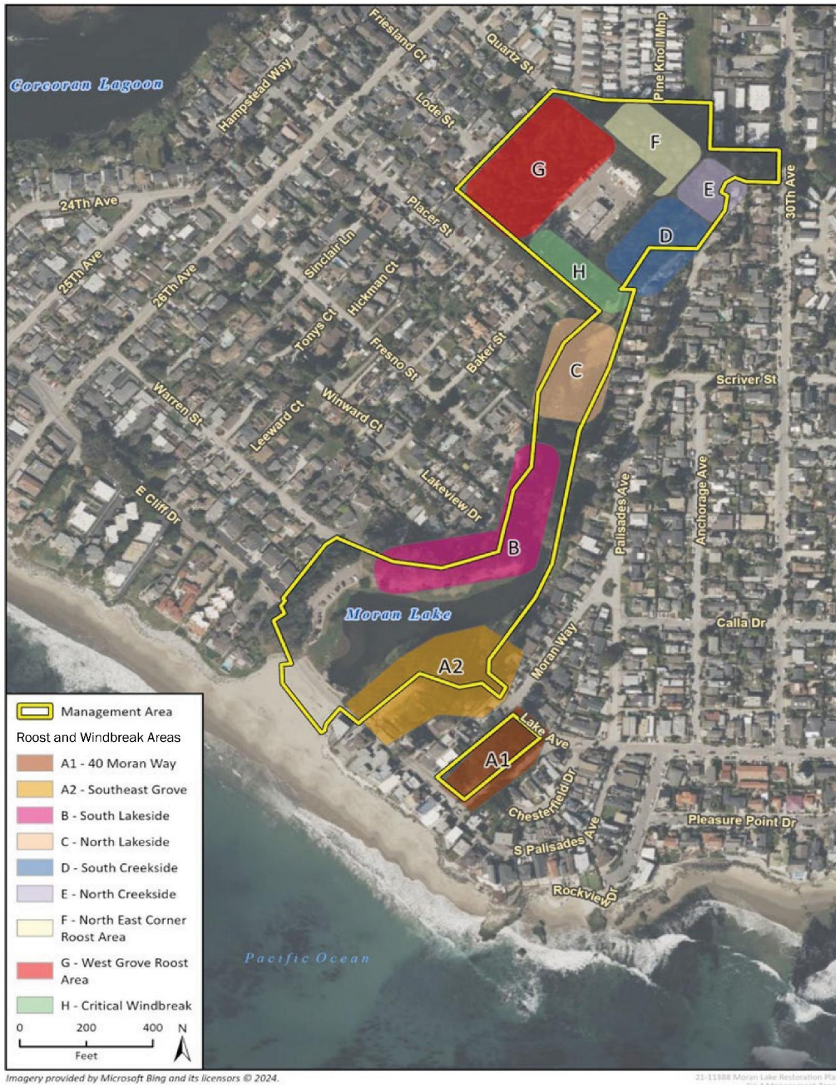
Figure 5 Monarch Butterfly Roost and Windbreak Areas